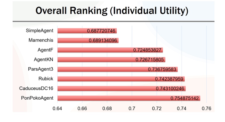
Fig. 3. Overall Ranking w.r.t. Individual Utility

Three main components of the negotiation agents contribute to their overall ranking: the bidding strategy, the opponent model and the acceptance strategy [7]. In the following part, the descriptions of the agents are given.