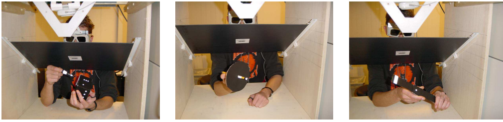
Figure 2. Examples of specific devices : A thimble for probing the object, a cutting plane device for cutting plane orientation, a ruler for distance measurements.

plement direct and intuitive interfaces and result in new interface styles.