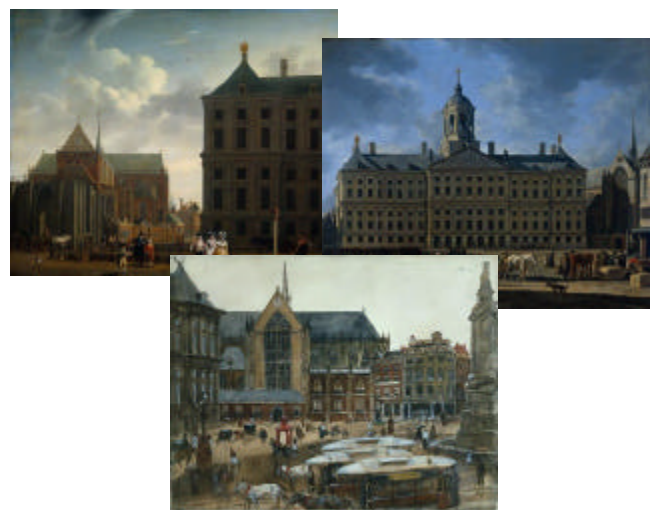
Figure 3: Three Rijksmuseum Paintings of Dam Square

Figure 4 shows the interface to the Dam Square Virtual Context. This interface is an integration of the display of the