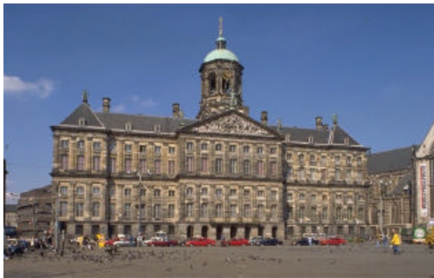
Figure 1: The “Real” Dam Square

These paintings convey information about Dam Square, its layout and its history. They show how the square and the buildings within it appeared at various periods in the past. They also show the position of structures in Dam Square that no longer exist. These paintings as a group provide